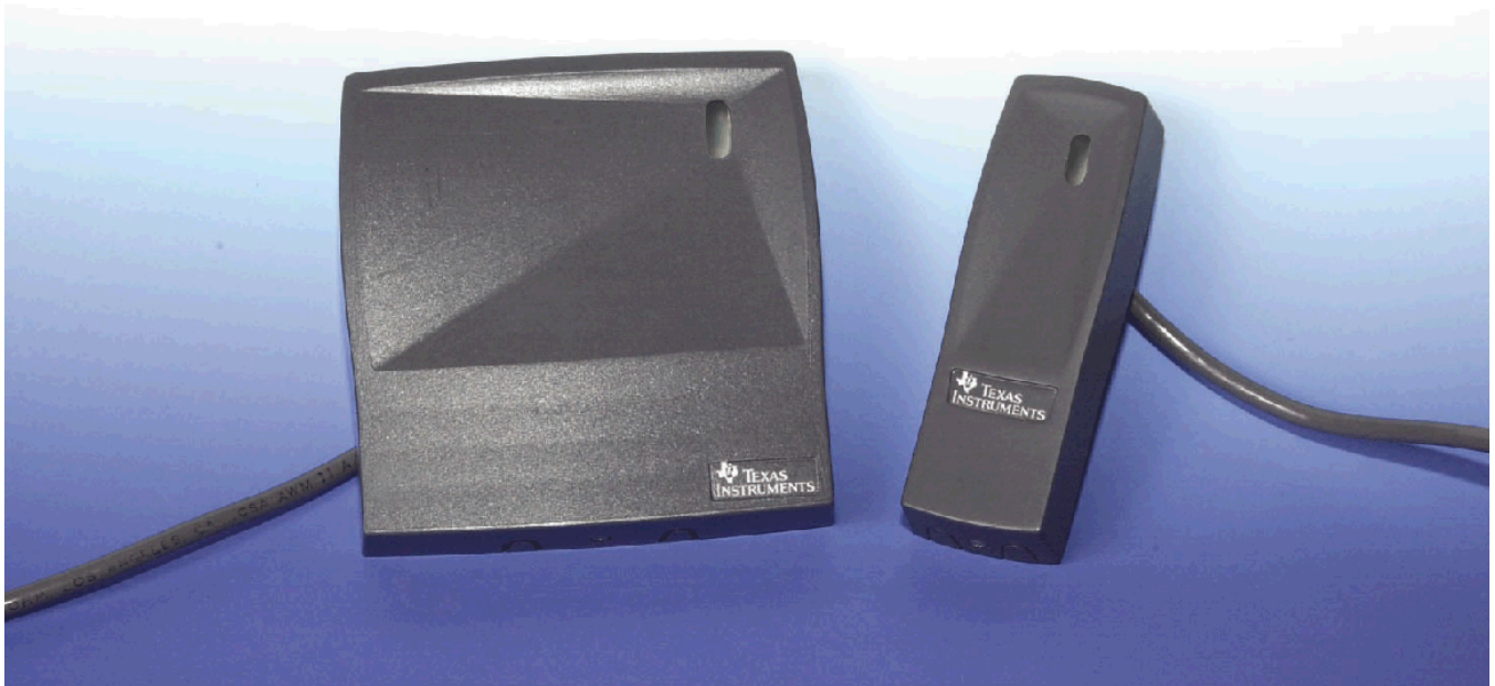
Figure 1. S6410 Wall Plate Reader (left) and S6420 Mullion Reader (right)

TI's 13.56 MHz 2000-bit memory and in-the-field programmability means users can add and update vital information like time stamps or employee authorization codes, certification or emergency medical histories.